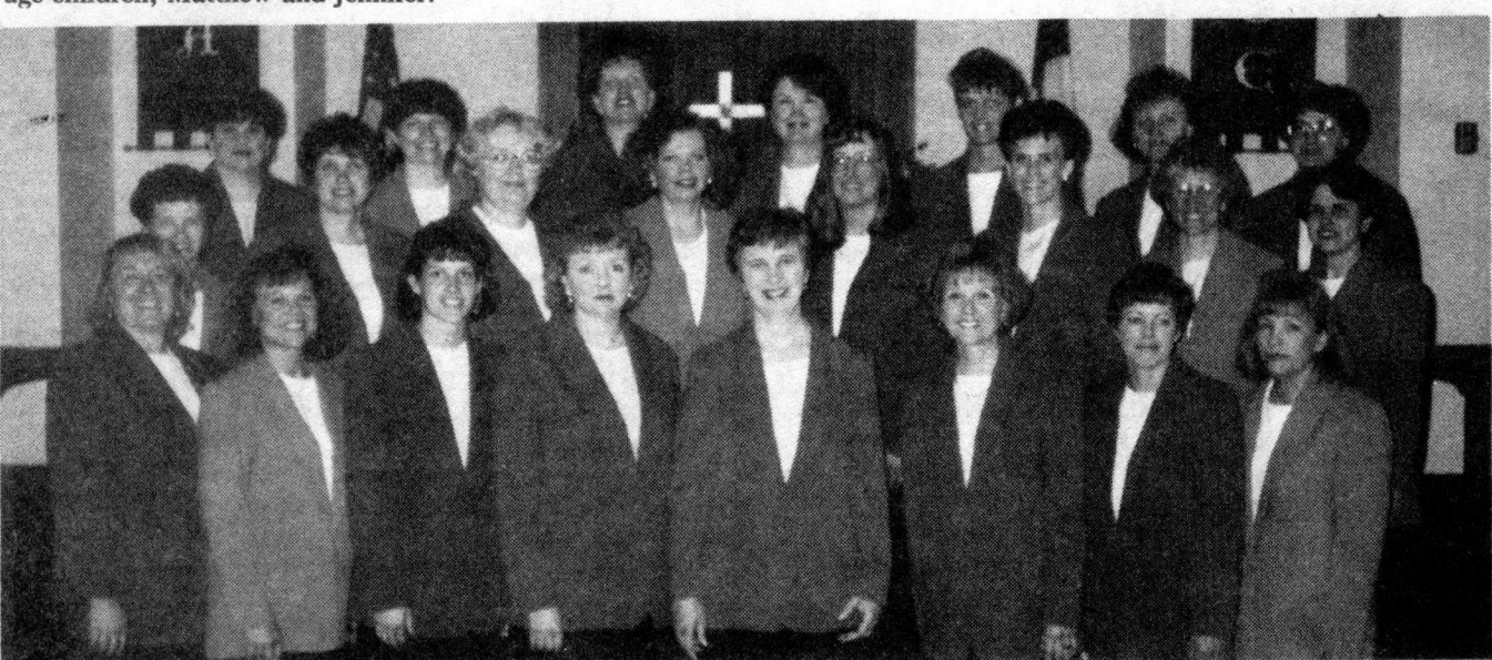
Philharmonic Music Club